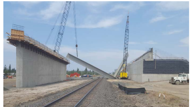
Crane Accident, La Pine, Oregon. August 2016

Currently, BNSF requires unified agreement language; expects all parties to understand expectations throughout the design and agreement phase; requires significant ownership by all parties; and requires specific closeout and the application of best practices.