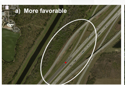
Examples of more and less favorable designs for freeway merging maneuvers.

This research first accessed the SHRP2 datasets and Maryland crash data extractions from the Study Center at the University of Maryland. Analyses showed that drivers are not yielding to pedestrians in marked crosswalks at both midblock and intersection locations, and pedestrians are failing to use or obey the safety measures such as marked crosswalks, sidewalks, and traffic signals already in place.