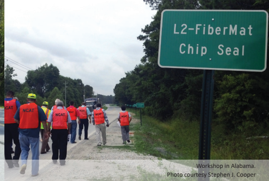
Workshop in Alabama.

“The guidelines provide a means of looking at preservation options to reconsider for high-volume roads because times have changed, the economy has changed, and the applications may be quite different now.”