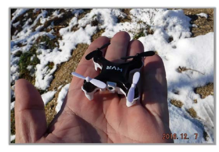
The micro drone used for interior framing system inspection.