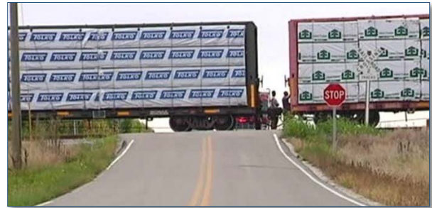
Train idling at crossing