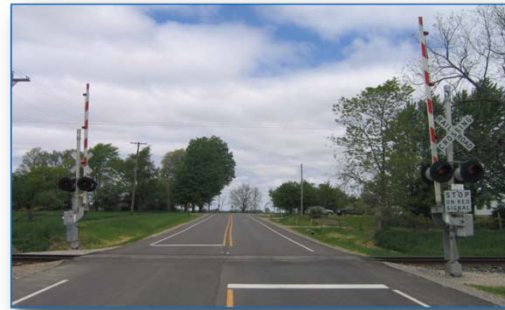
Michigan Grade Crossing

The state also holds an annual rail conference that offers new staff the opportunity to meet their railroad partners face-to-face. Whenever a new railroad public project engineer is identified, the state holds a meeting with the railroad to ensure that all parties are familiar with their processes. Michigan also has an in-house Railroad Project Management System that allows users to track and move projects through the entire process, allowing electronic sign offs as needed.