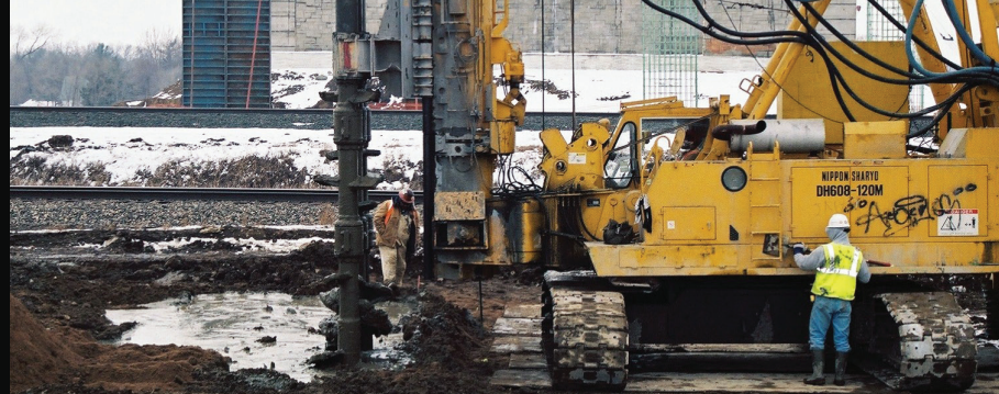
Systematic Maintenance.