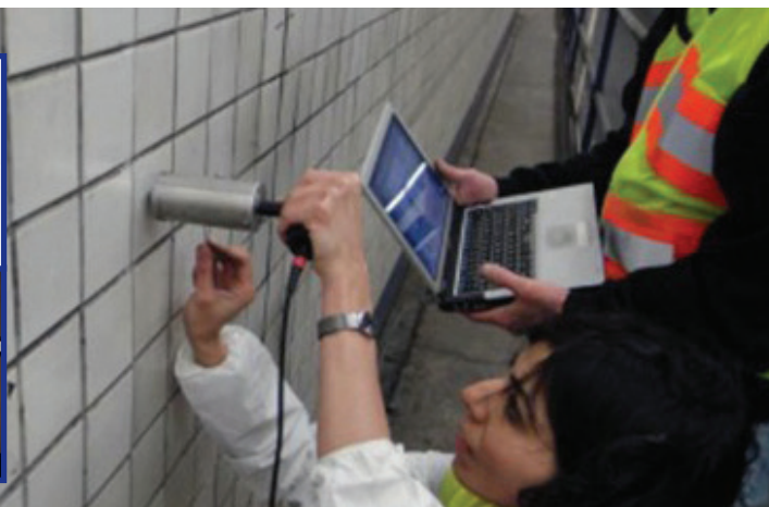
State participants gather to observe hand held (or various types of) NDT equipment testing on tunnel infrastructure.