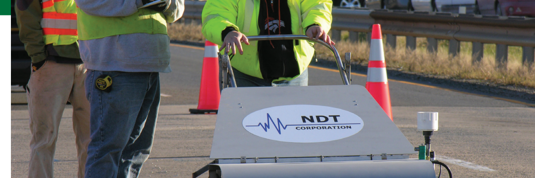
Researchers collect data efficiently using NDT equipment on bridge decks.

By using Service Life Design for Bridges (R19A), DOTs and other bridge owners can apply a formal approach to service life design either programmatically or individually. Owners can plan, design, construct, evaluate, and preserve bridges and bridge components for a targeted service life and create a uniform process that leads to a life-cycle cost analysis to assist in the decision-making process. The product includes design methods that take into account materials, environmental factors, and new technology to allow for a longer service life of bridges. For helpful tools and information, visit: http://shrp2.transportation.org/Pages/ServiceLifeDesignforBridges.aspx .