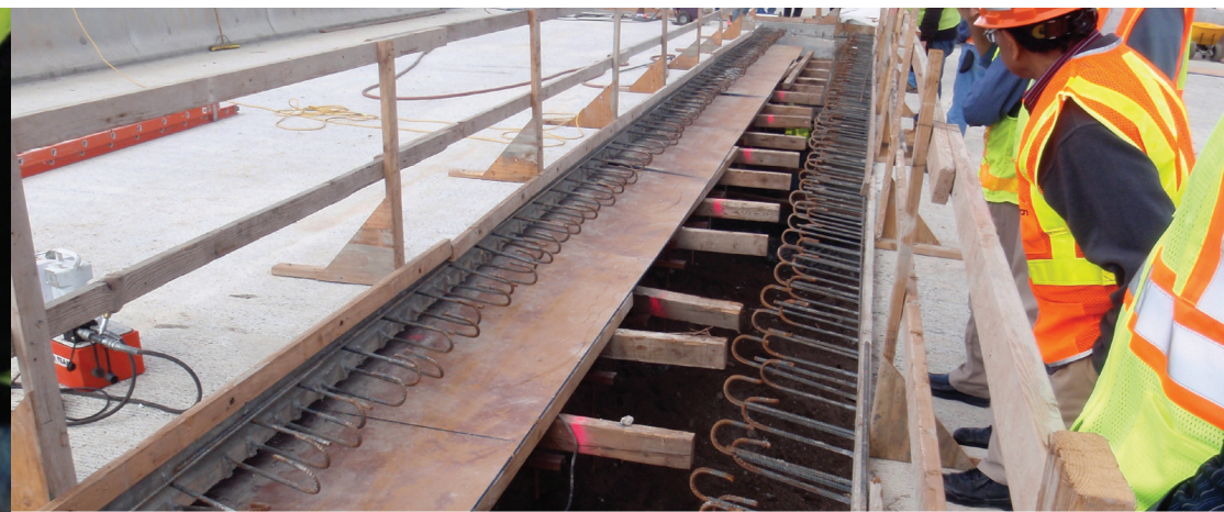
Hydraulic pumps help slide the new and improved Gila River Bridge (Str. 145) in place significantly reducing the long detour caused by the bridge closure for the Gila River Indian Community in Sacaton, Arizona.