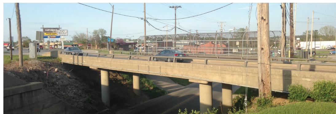
Missouri has done multiple ABC bridges including Route B Business Loop over Route 70 in Boone County.

With scarce resources, DOTs must design and build new structures to have the longest service life possible. Not only will this approach reduce the pressure on construction budgets, it can also free up funds for preservation activities, pushing out maintenance on new projects and providing more dollars for repairs on existing structures.