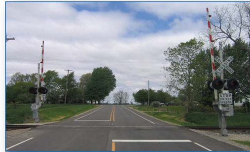
Michigan Grade Crossing

In addition, Michigan’s Section 130 process enables the railroad’s train crews to notice and report anything unusual and potentially hazardous to the DOT. The state also works closely with localities and offers incentives to local authorities to close railroad crossings wherever possible, given that roughly 4,400 of the state’s 4,600 crossings are on roads for which local transportation agencies are responsible.