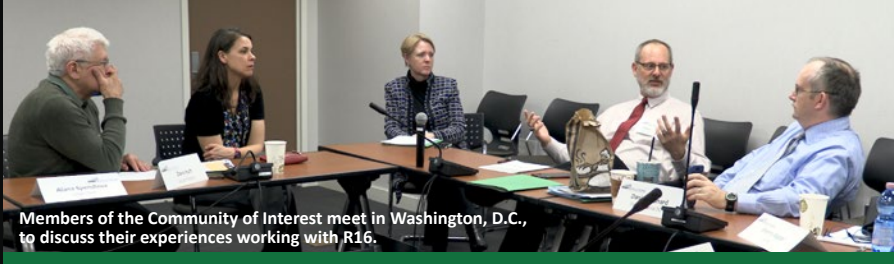
Members of the Community of Interest meet in Washington, D.C., to discuss their experiences working with R16.