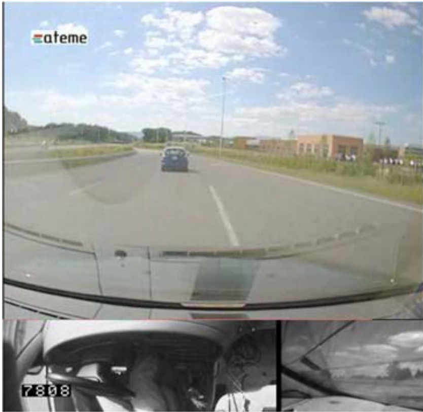
Figure 1 The views from which video data were collected.