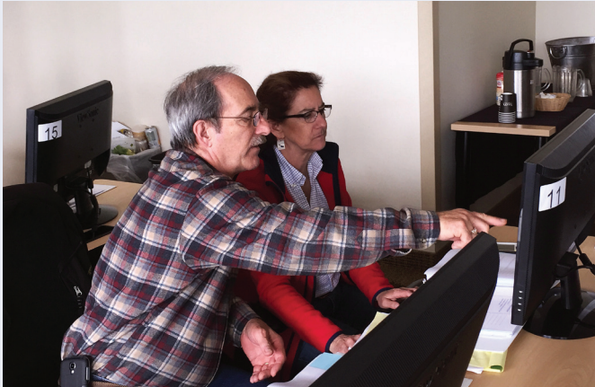
Figure 6: ODOT participants collaborate during the training.

“ I see the power in risk management, and the R09 template is flexible and simple enough for our project managers to apply it to nearly every project. By proactively identifying risks and mitigation actions, we can talk to stakeholders about project needs early, and avoid costly, unexpected surprises down the road. ”