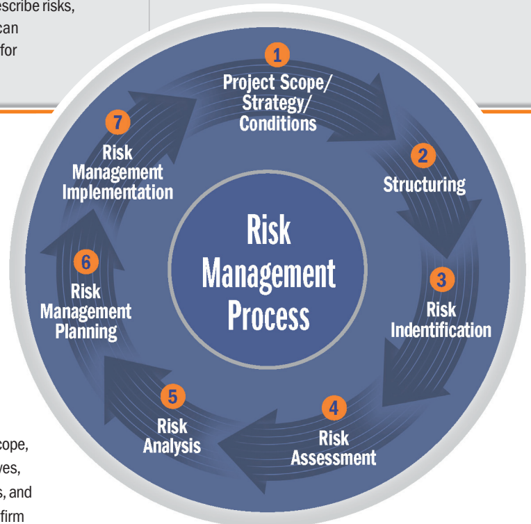
Figure 3: R09 Risk Management Process Steps

Structuring is the second step, which involves defining the base project scenario for cost and schedule/duration (base performance). The base performance does not account for any project risks, which are typically accounted for by way of contingencies and intentional schedule float. The base performance is determined by the R09 template by entering cost and duration information per project phase (e.g. planning, scoping, design/environmental process, procurement, final design, construction) without considering any built-in contingencies and intentional schedule floats. The base performance will be compared against the unmitigated and mitigated project performances later, which include unmitigated risks and some mitigated risks, respectively. Table 1 includes the base project performance results from the QDOT example.