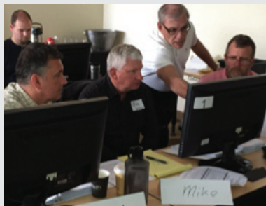
Figure 2: ODOT participants complete exercises using the R09 template during a training class in Salem, Oregon.

of each project and could be done in-house.