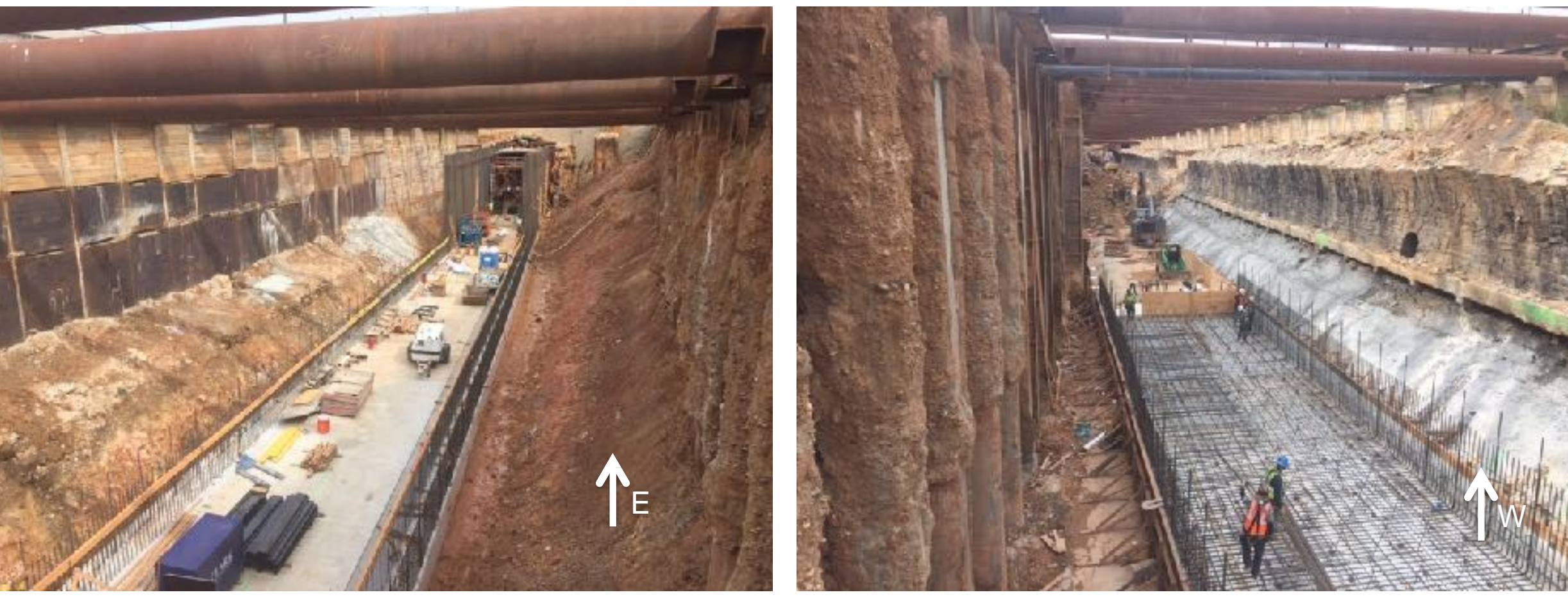
Tunnel Inverts and Walls