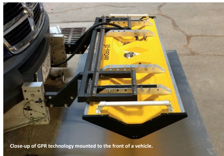
Close-up of GPR technology mounted to the front of a vehicle.

GPR has some major advantages, especially that it can be used at higher speeds and covering large areas. Since it can be used at highway speeds, transportation agency staff can use this technology in live traffic, eliminating the need for closures. The GPR technology can detect certain delamination issues, but it cannot distinguish new debonding problems where the bond between the asphalt lifts is weak. For the technology to be effective, the asphalt layers being tested must be separated with air or water.