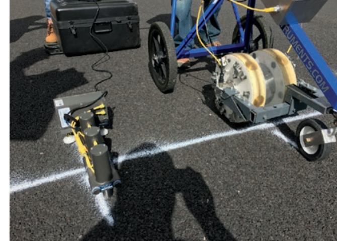
SASW/IE manual point testing (left) and automated testing (right).