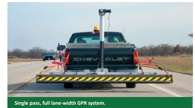
Single pass, full lane-width GPR system.