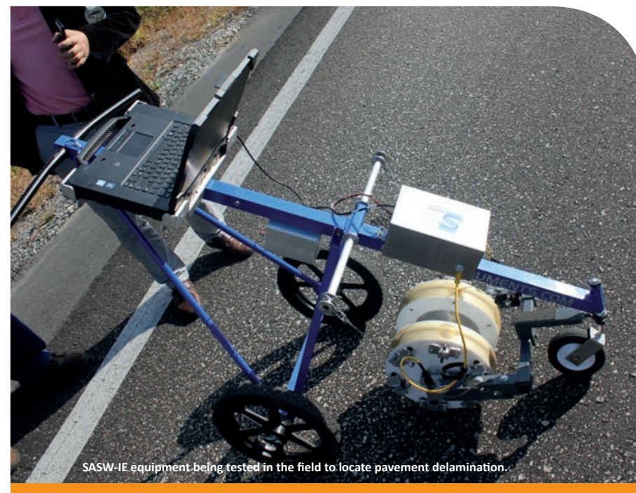
SASW-IE equipment being tested in the field to locate pavement delamination.

Advanced Methods to Identify Pavement Delamination