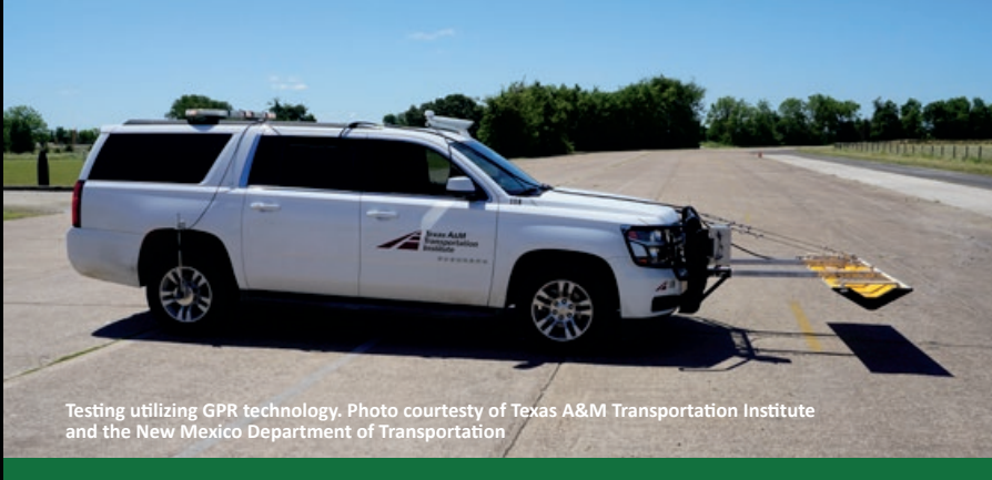
Testing utilizing GPR technology.

R06D is just one product in a SHRP2 series that focuses on nondestructive testing (NDT) technologies and their current state of implementation for bridge, pavements, and tunnel renewal. You can learn more about the suite of NDT SHRP2 products at http://shrp2.transportation.org/Pages/NondestructiveTesting-Solutions.aspx .