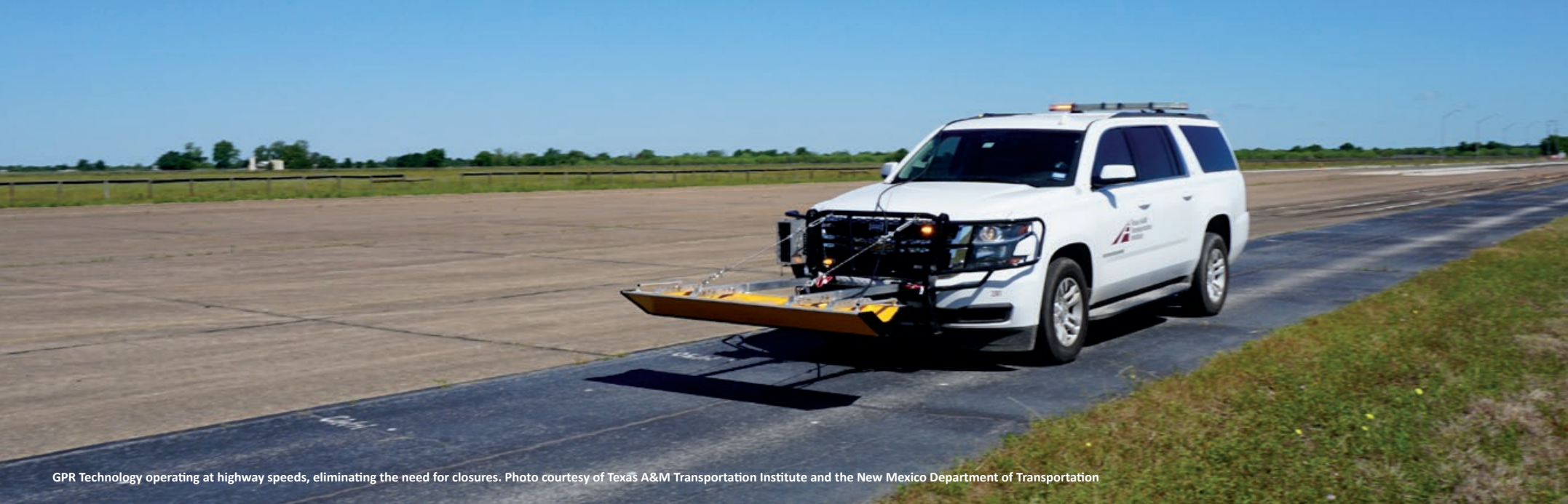
GPR Technology operating at highway speeds, eliminating the need for closures.

“Florida Department of Transportation is always looking into finding more innovative ways to monitor the performance, condition, and safety of its roadway infrastructure. Of greatest interest are those that would provide for versatility, ease and speed of use, which is why we are very interested in the SHRP2’s R06D technologies. We believe they hold great promise of improving pavement structural adequacy evaluation while minimizing maintenance of traffic, expediting projects acceptance, and minimizing impact to the traveling public.”