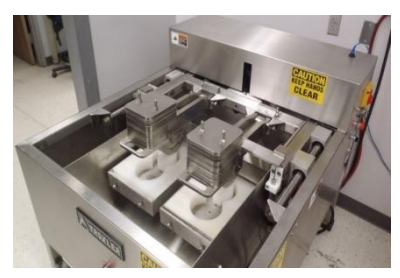
Hamburg Rutting Tester

MoDOT has subsequently applied for and received approval for an extension of its IAP project in order to address mixture designs using advanced testing protocols, including the Flexibility Index Test (I-FIT) for cracking, Hamburg Test for rutting, and the Asphalt Mixture Performance Tester (AMPT) for Dynamic Modulus, Tri-Axial Stresses, and Cyclic Fatigue testing for asphalt materials mixture designs. The SHRP2 extension includes MoDOT laboratory testing of asphalt materials with all the technologies to develop internal experience on using the equipment and to establish performance thresholds based on mixture types for inclusion in future shadow projects.