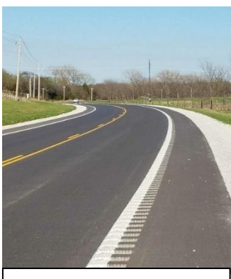
MoDOT Rte. 24, Randolph County

During summer of 2015, the SHRP2 subject matter expert (SME) began working with MoDOT construction/materials and research offices to advance their development of performance specifications. MoDOT made the decision to develop its