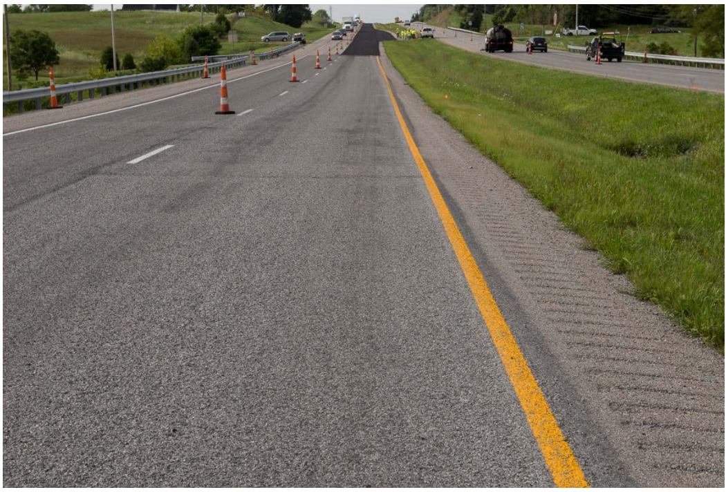
Figure 3. Chip Surface before Cape Seal Microsurface Placement

KYTC also adopted a proactive step informing the public about the treatment that would be applied to the roadway. The process starts during the project development phase to determine the best means for conveying the information to the public. Depending on the project location and traffic level, various outreach tools are used such as news media releases or hand-delivered flyers.