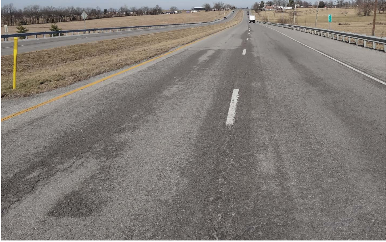
Figure 2. Pretreatment Condition of U.S. 127 (southern section) in Mercer County

The KYTC has previously installed a 1.5-inch dense graded asphalt overlay on U.S. 127 in 2012 on the northern site and in 2003 on the southern site. Therefore, treatments on the northern site were applied on 1-year-old pavements. KYTC reported low distress extent and severity at this site before treatment application. The surface age on the southern section was 11 years at the time of treatment and, as shown in Figure 2 below, the pavement exhibited varied distresses throughout the section. A pavement distress survey conducted just prior to application of the surface treatments identified extensive, moderate-severity, top-down fatigue cracking, and extensive raveling of the pavement surface. The southbound lanes showed slightly more extensive distress than the northbound lanes. KYTC hopes to use this test section to gain a sense of the treatment life and benefit for each treatment, so that ultimately treatment applications can be timed to yield a longer life cycle and minimize the life-cycle cost.