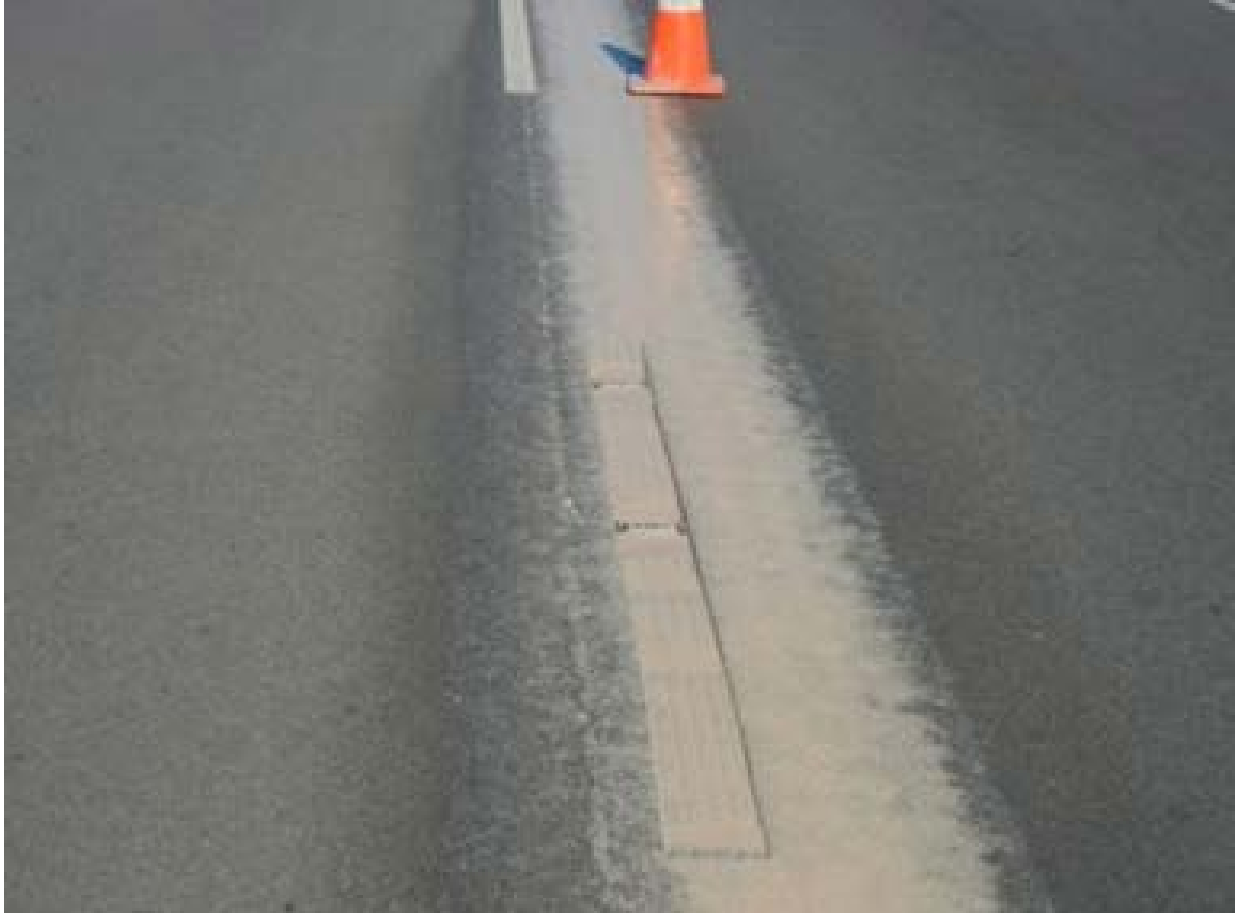
Figure 4. JointBond Longitudinal Joint Stabilizer within Minutes of Application

The process that KYTC employed has resulted in several benefits. First and foremost, placing the test sections has generated confidence in the treatments themselves. Constructing the test sections required a planned approach to monitor treatment performance, which has also proven beneficial. In establishing the implementation project, the process has fostered the development of an agency preservation alliance to share regional experiences horizontally across the agency.