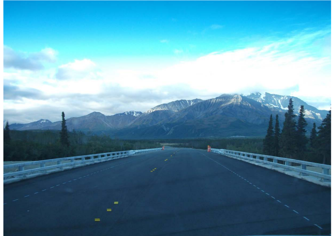
September 1, 2012