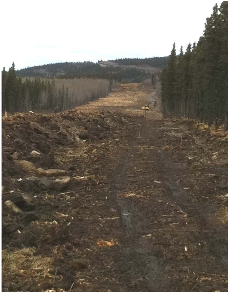
May 10, 2012